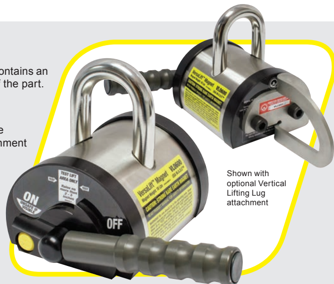
Shown with optional Vertical Lifting Lug attachment

To operate Test Feature, pull spring loaded handle out and rotate it to the "TEST" position. Lift load approx. 2-3" to verify the magnet has the capacity to lift your load. Once verified, place load back down and turn the handle to the "ON" position. Never complete entire lift operation in "TEST" position.